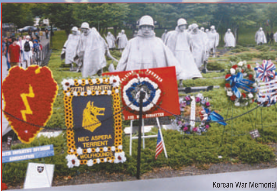
Korean War Memorial

The Rolling Thunder demonstration left the Pentagon parking lot at