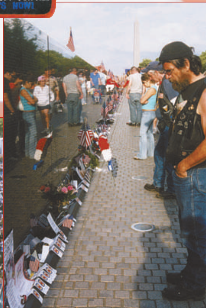
People reflect at the Vietnam War Memorial in Washington, D.C