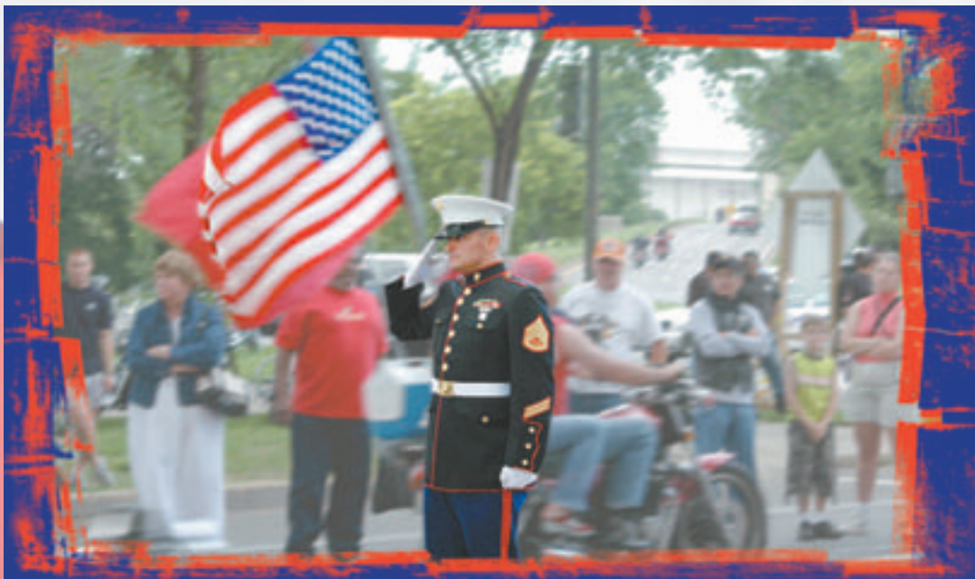
Rendering honors to the flags of the US and Marine Corps